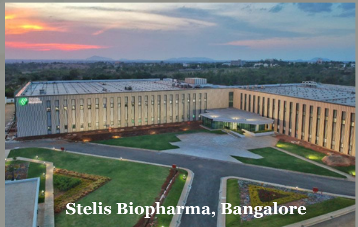
Stelis Biopharma, Bangalore